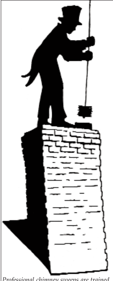
Professional chimney sweeps are trained to inspect and clean chimneys.